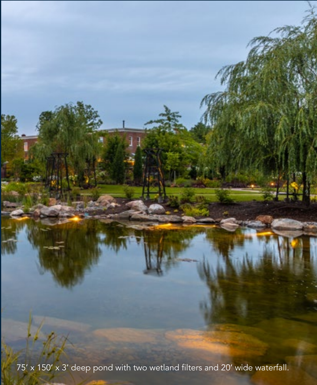
75' x 150' x 3' deep pond with two wetland filters and 20' wide waterfall.