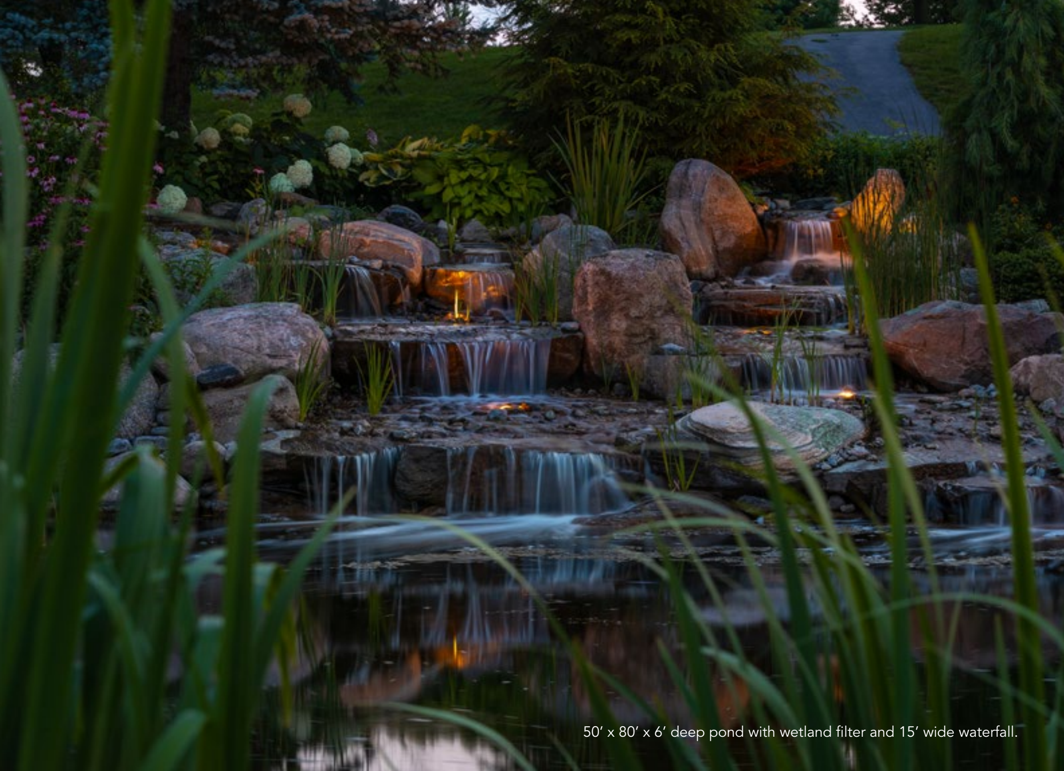
50' x 80' x 6' deep pond with wetland filter and 15' wide waterfall.